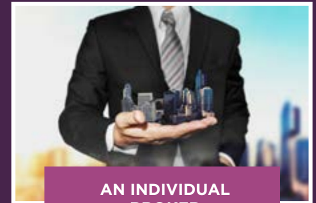
AN INDIVIDUAL BROKER