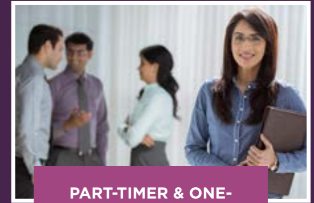
PART-TIMER & ONE-MAN-SHOW